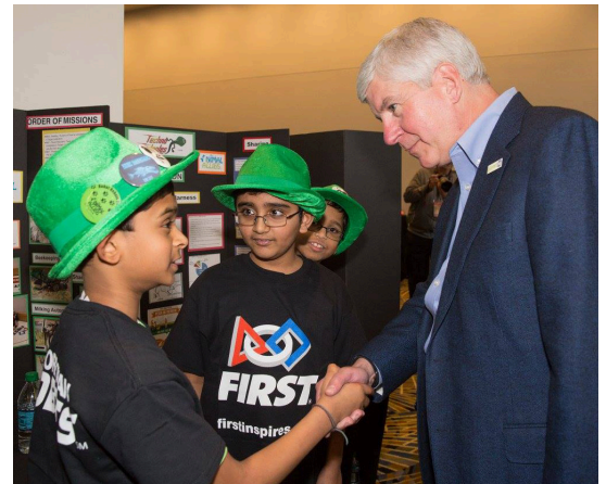
Michigan Governor Rick Snyder meets with FIRST LEGO League Team 4182 “Techno Tadpoles” during the 2017 North American International Auto Show in Detroit.

Championed by Michigan Governor Rick Snyder, FIRST has become the state’s premier STEM-based after-school program. For the 2013-2014 school year, the state of Michigan marked $3 million for grants for school districts to fund FIRST Robotics Competition and FIRST Tech Challenge teams. The grant is funded through an appropriation under the Michigan State School Act, Section 99h. The state invested another $2 million in the grant program for 2014-2015 and again in 2015-2016. During the 2016-2017 school year, the state made $2.5 million available to expand the grants to include FIRST LEGO League and FIRST LEGO League Jr.