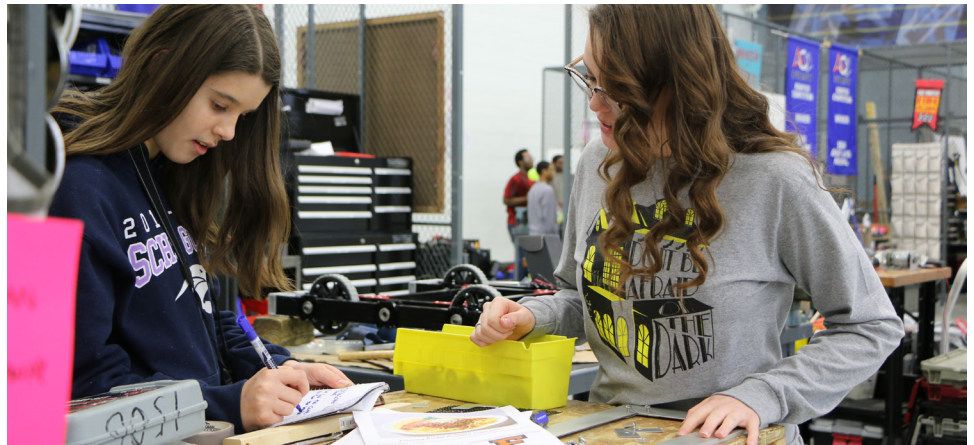
FIRST participants work on their robot at the FIRST Center at Kettering in Flint, Michigan.

Many FIRST alumni from Kettering University have gone on to work for the Big Three automakers.