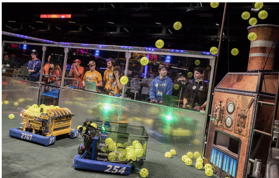
Two Michigan FIRST Robotics Competition teams – Team 862 "Lightning Robotics" of Canton and Team 2767 "Stryke Force" of Kalamazoo – compete together on the winning alliance at FIRST Championship 2017 in St. Louis.