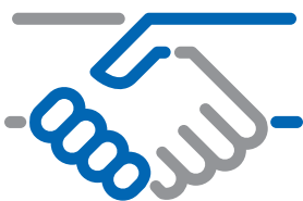
EMPHASIS ON FIRST CORE VALUES