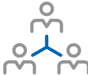
EXPOSURE TO CAREERS AND ADULT MENTORS